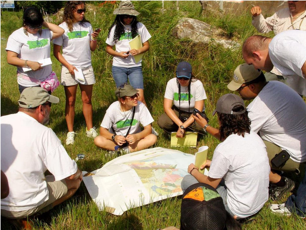
PR-LSAMP Students' Field Trip